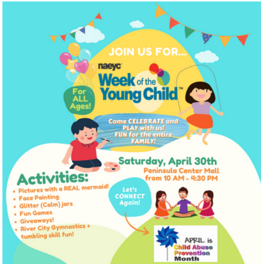
Central Peninsula CAC and SAFR's event combined family fun with information on resources and services!

The Central Peninsula CAC helped organize a fun day at the mall event at the Peninsula Center Mall in Soldotna. The event was in partnership with the Southcentral Alliance for Family Resilience.