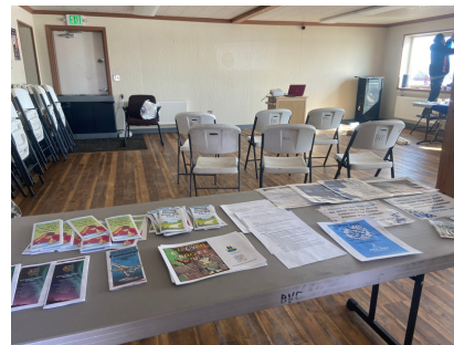
Beaver Village Council gave out materials on a variety health challenges and resources that can help at their community event!

VOA hosted a Family Night combining its Family Support Group and Kinship Cafe to connect caregivers to VOA and inform them of VOA's services and other resources. VOA also created a series of April blog posts on Strengthening Families.