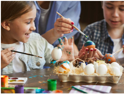
VOA's second Strengthening Families blog post highlighted the importance of social connections. Blog posts throughout the month raised awareness of the Strengthening Families framework.

RurAL CAP's family advocate hosted a meal for Head Start families - providing a safe place for families to discuss their challenges in a safe, supportive environment.