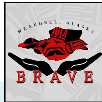
BRAVE aired Prevent Child Abuse America's radio spots to spread the word on child abuse and neglect.

BRAVE, a volunteer group focused on preventing violence and building family resiliency in Wrangell, aired radio spots on Child Abuse Prevention Month throughout April!