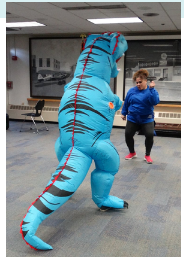
Even ACT's blue dinosaur enjoyed the Polynesian dancing at PIC's Go Blue Day event!

KCI created a Prevention Month display for families and gave out information on resources and skill-building activities for parents. KCI centers did Prevention Month themed activities every week in April!