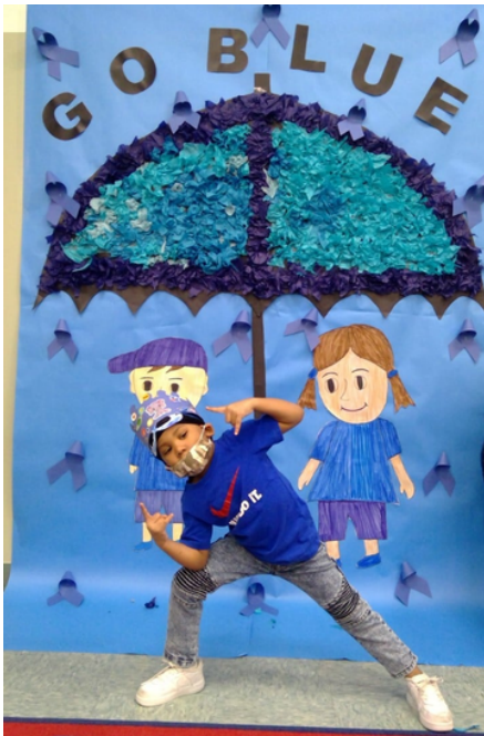
Students at KCI celebrated Go Blue Day on April 1 and did fun Prevention Month activities throughout April.

Best Beginnings put together 200 Prevention Month activity kits with coloring books, crayons, make-your-own pinwheel materials, growth charts, and educational resources for parents on preventing child abuse. They distributed them via Free Little Libraries at parks across Anchorage!