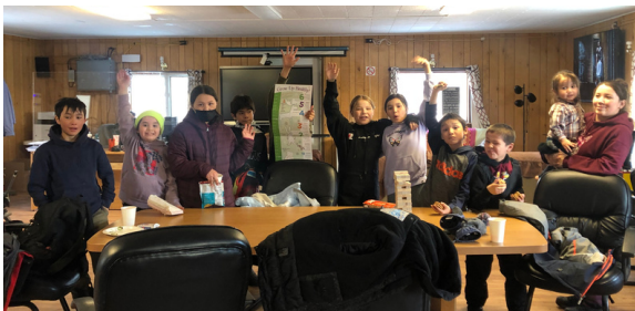
CATG event attendees showing off ACT's Prevention Month growth charts!

Beaver Village Council hosted a Go Blue Day event to bring the community together for activities and food, followed by a short video on child abuse and neglect prevention.